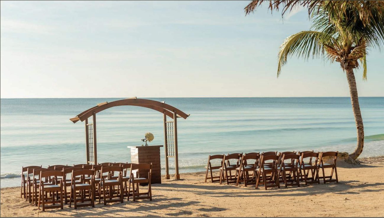
BEACH COMPLIMENTARY SETUP