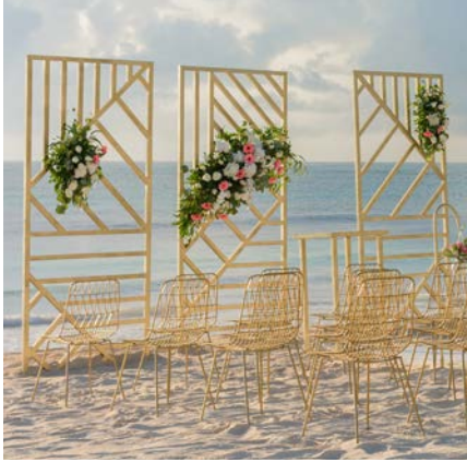
Ceremony structure detail