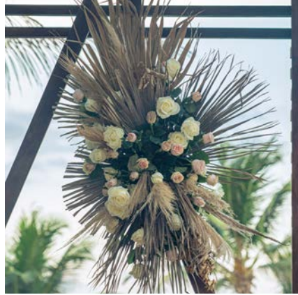
Ceremony structure flowers