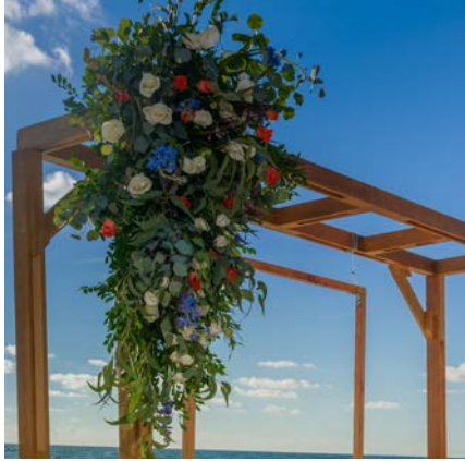
Ceremony structure flowers