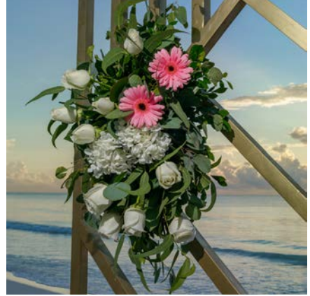
Ceremony structure flowers