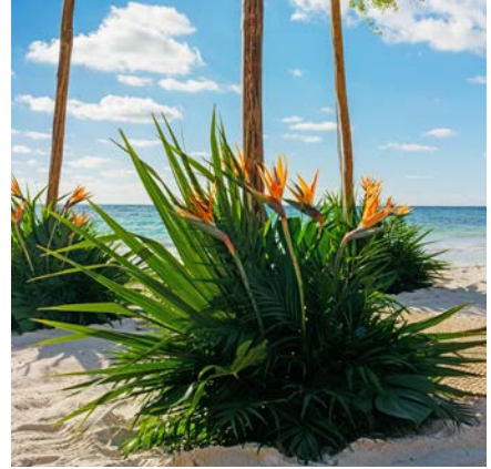
Ceremony structure flowers