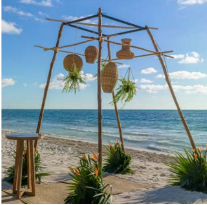
Ceremony structure detail