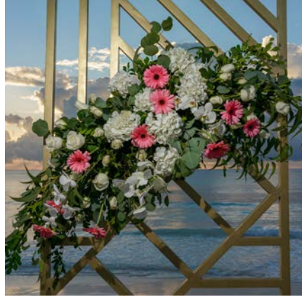
Ceremony structure flowers