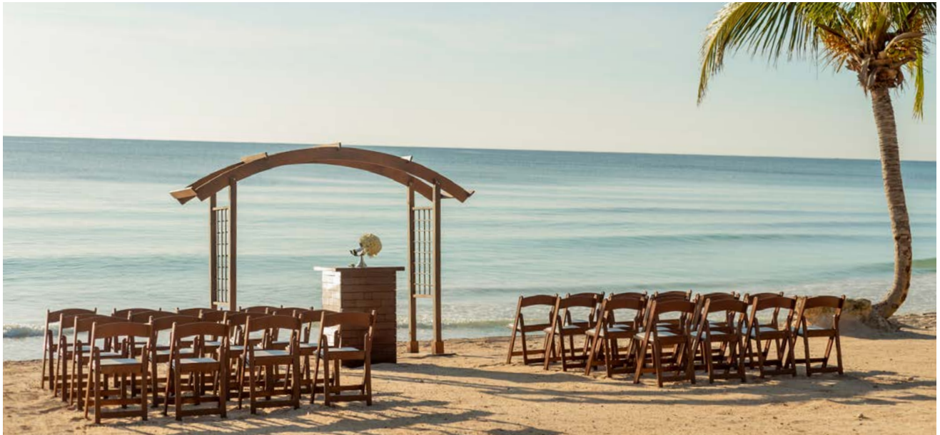
Beach Complimentary Setup

The following ceremony decor details are available when choosing the Compliments of UNICO 20° 87°.