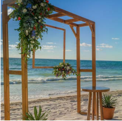
Ceremony structure detail