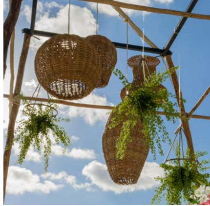
Ceremony structure flowers