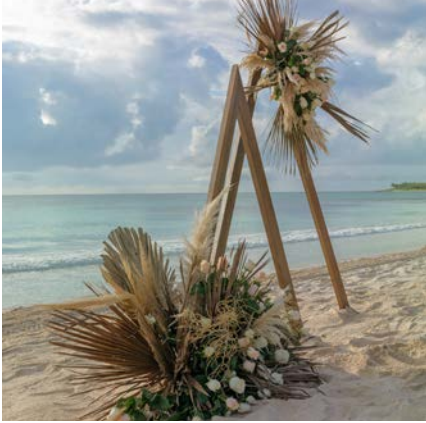
Ceremony structure detail